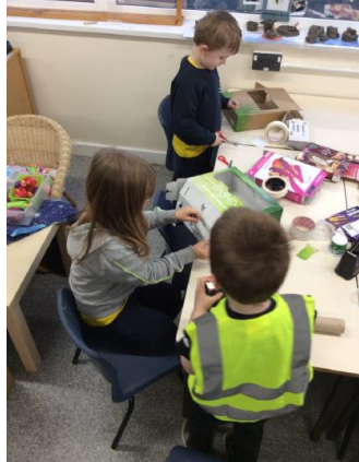
Sikh Gurdwara Creation in C1