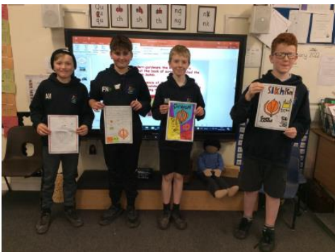
Y6 Sikhism posters for younger years